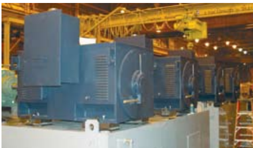
800 HP on hydraulic pumps for forging presses