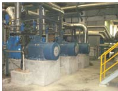
Disc refiner drivers in a pulp and paper mill